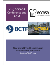
Victoria pages 9-11