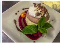
Mahle House pages 6-8